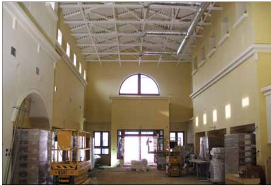
The School Age Services activity room, at left. The SAS will have a large multi-purpose space for dancing, roller blading and other group activities. It also includes a central gathering space with a high-ceiling and specialty rooms for computers.

“In addition to general purpose classrooms, each school has rooms dedicated to art, science, music and special needs learning,” said Razzaghi. “Both schools have two levels with elevators, wide stairs and corridors and are handicapped accessible in accordance with the